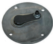
BOTTOM SUCTION LID