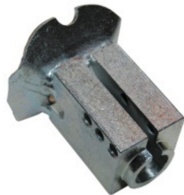
V-012 ENGINE COUPLING