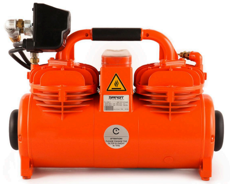
V-001 AIR COMPRESSOR