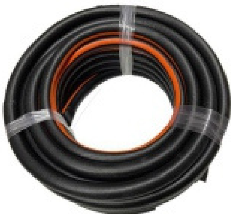
V-005 AIR HOSE