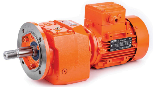
V-002 DRUM PUMP