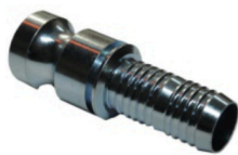
MORTAR HOSE APPARATUS