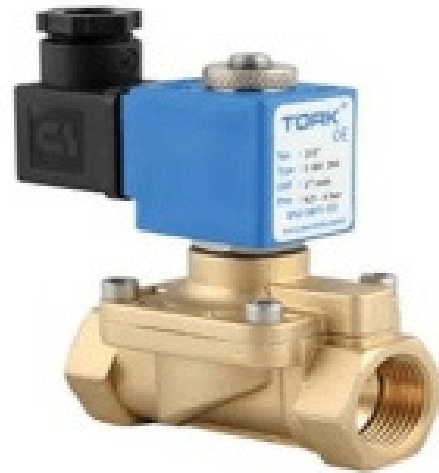
V-010 SOLENOID VALVE