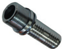
MORTAR HOSE APPARATUS