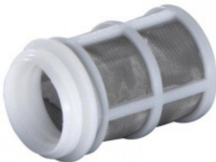
V-011 CYLINDER FILTER