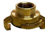
GEKA COUPLING 1/2'