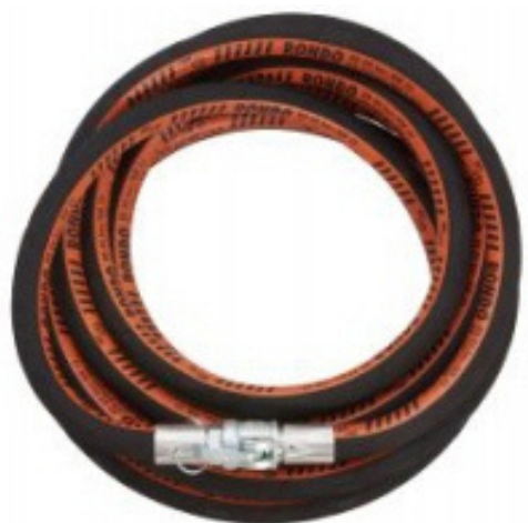
V-006 MORTAR HOSE