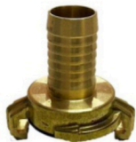
GEKA COUPLING 13-19MM