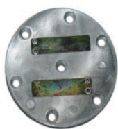
UPPER SUCTION LID