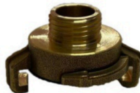
GEKA COUPLING 1/2'