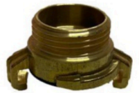
GEKA COUPLING 1'