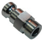
BOTTOM FLANGE OUTPUT