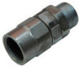
SPRAY GUN APPARATUS