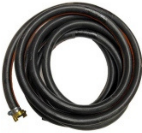
V-007 WATER HOSE