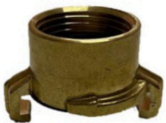
GEKA COUPLING 1'