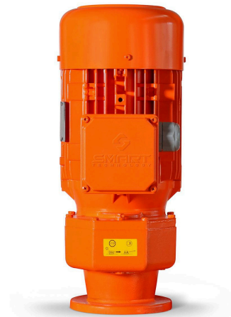
V-004 MIXER PUMP